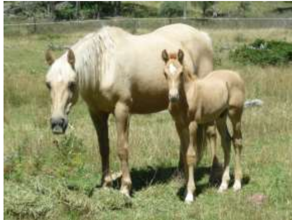
Meet STB Miracle. 'Hey neigh to you all, I should not be here 'cos my Mum 'n Dad are in the fertility control trial but the Team are very happy with me 'cos they say I'm just a stunning, perfect colt, how 'bout that then' ????

Foals are all healthy and normal, they will be offered for Adoption on weaning at the end of the year. No adverse results or birth defects were presented.